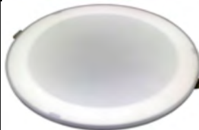
Surface Fortune 10W/15W