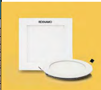
LED Panel Slim