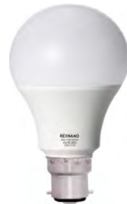
Globe 270 Degree