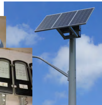
Solar Street Light