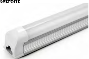
T5 Batten Wallmount