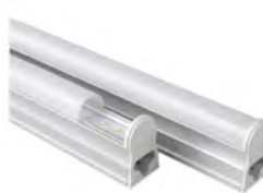
T5 9W Slim Wallmount