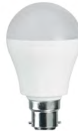
Globe 180 Degree