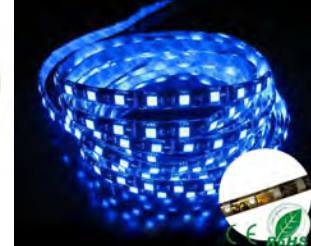
LED Strip Lights