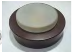
Surface Fortune 5W