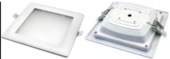
Neoma / BG-SQ